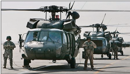
A familiar scene of U.S. helicopters and soldiers at Baghdad International Airport, known in military lingo as BIAP (pronounced buy-op).